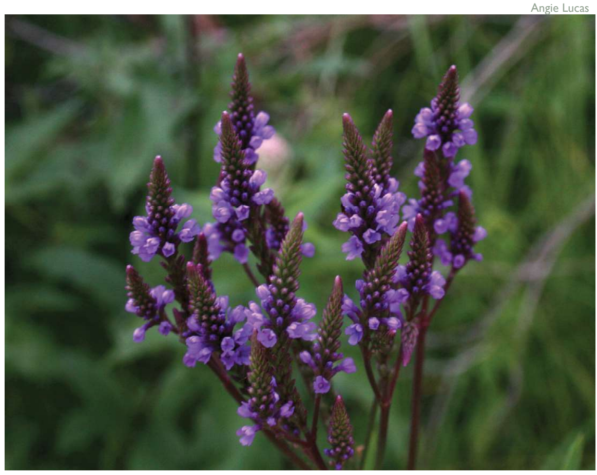
Is blue vervain right for your garden?